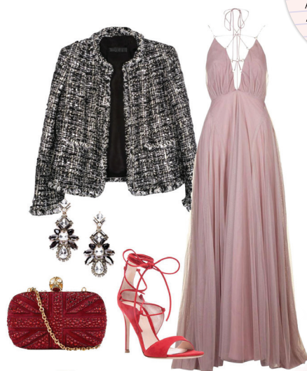
Red Carpet Warrior