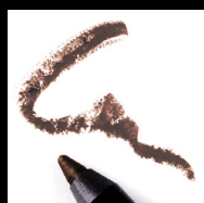
2L Pearly Brown