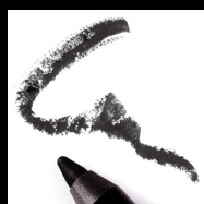
01 Matte Black

MAKE UP FOR EVER PROFESSIONAL AQUA EYES COLLECTION