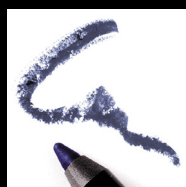
3L Iridescent Navy Blue