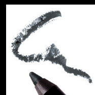
21L Dark Grey

MAKE UP FOR EVER PROFESSIONAL AQUA EYES COLLECTION