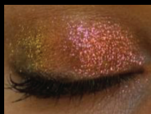
COPPER Pink, orange and yellow highlights