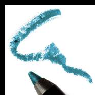
12L Blue with Green Highlights