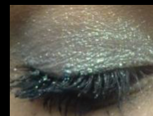
WHITE Gold, green and blue highlights