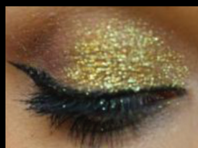
BROWN GOLD Yellow, green and blue highlights