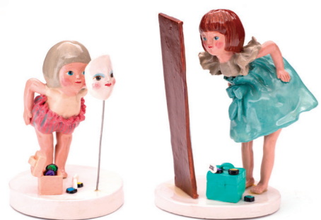
Miniature MAKE UP FOR EVER products accompany cute and confident porcelain girls.