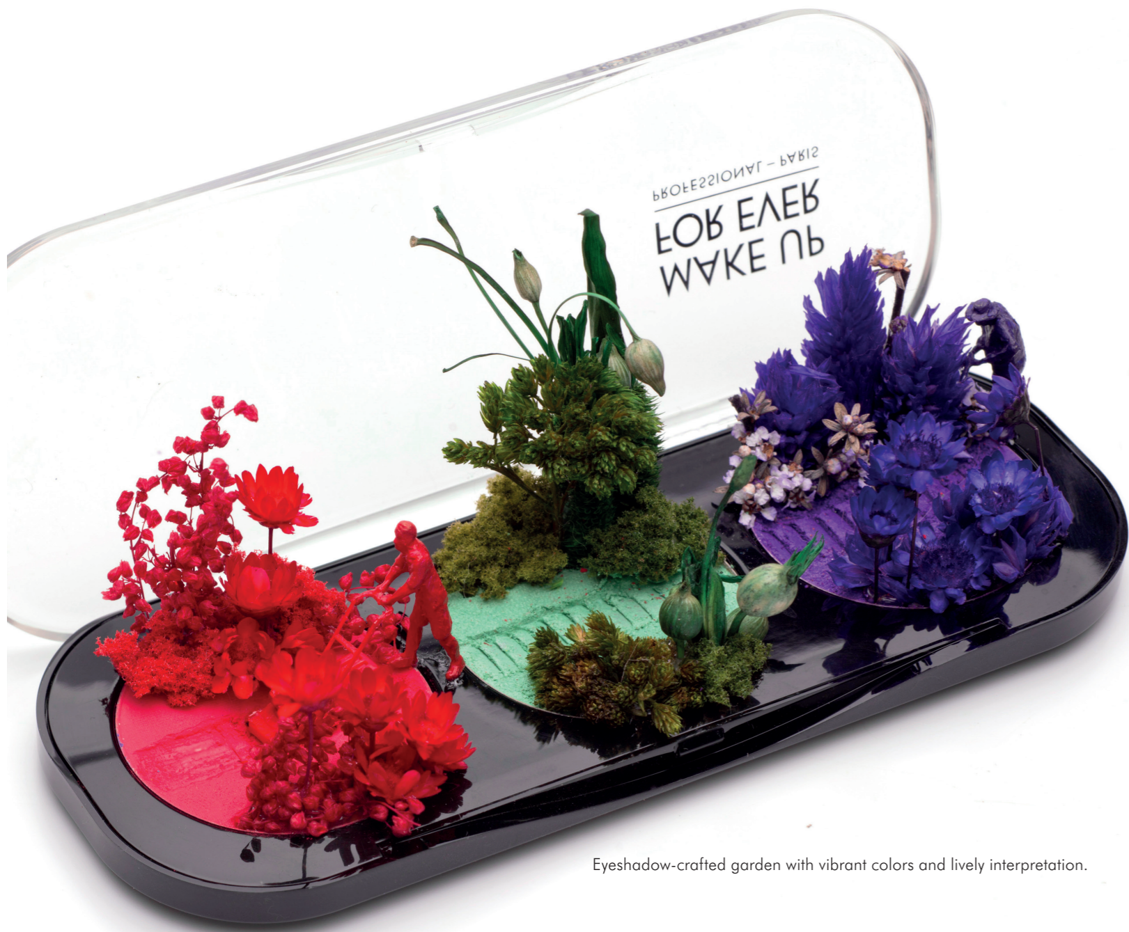
Eyeshadow-crafted garden with vibrant colors and lively interpretation.