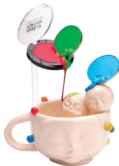
The colors from Artist Shadow make this art come alive.