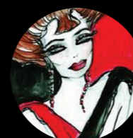
MAKE UP FOR EVER 2010 Moulin Rouge Hand-crafted