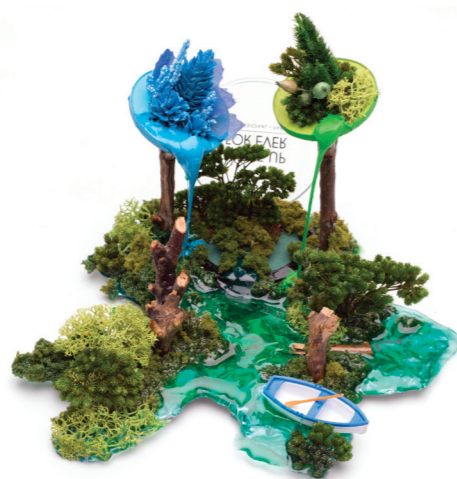
Eyeshadow-crafted forest exudes relaxation and happiness.