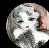
MAKE UP FOR EVER 2010 Black Tango Hand-crafted