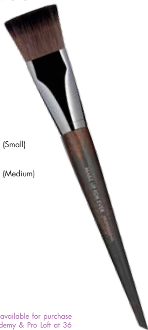
406 Body Foundation Brush (Small)